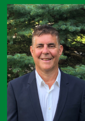
C. Med, C. Arb, LL.B

Learn about Prevention & Set-Up for Problem-Solving in the Future, how to use a Mediation/Facilitation Approach, and Mediator Skills & Techniques to navigate potential workplace issues.