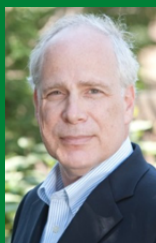
C. Arb., LL.M (ADR), LL.B

The Legislation & Regulations that apply to Cannabis