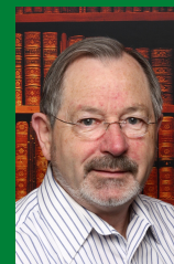
C. Med, C. Arb

Problem-Solving/Mediating with Management's & Union's Considerations in Mind