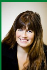
C. Med, Q. Arb, LL.B