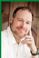
SSgt O.P.P, JD

Learn about Cannabis, the ways in which it is available for consumption, the affect it has on a person's body, and when it causes impairment.