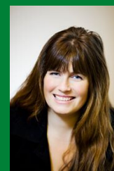
C. Med, Q. Arb, LL.B